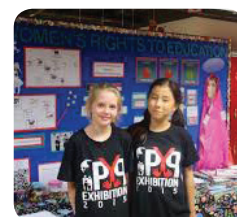
Students during the PYP Exhibition